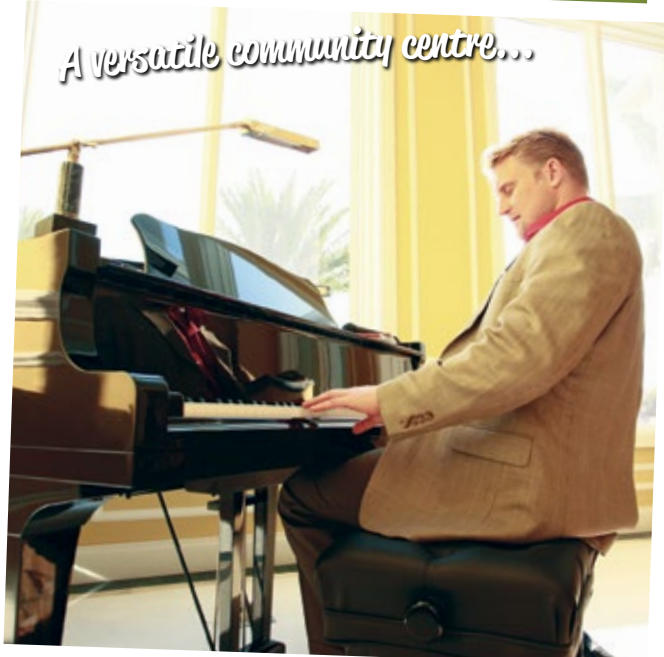
A versatile community centre...