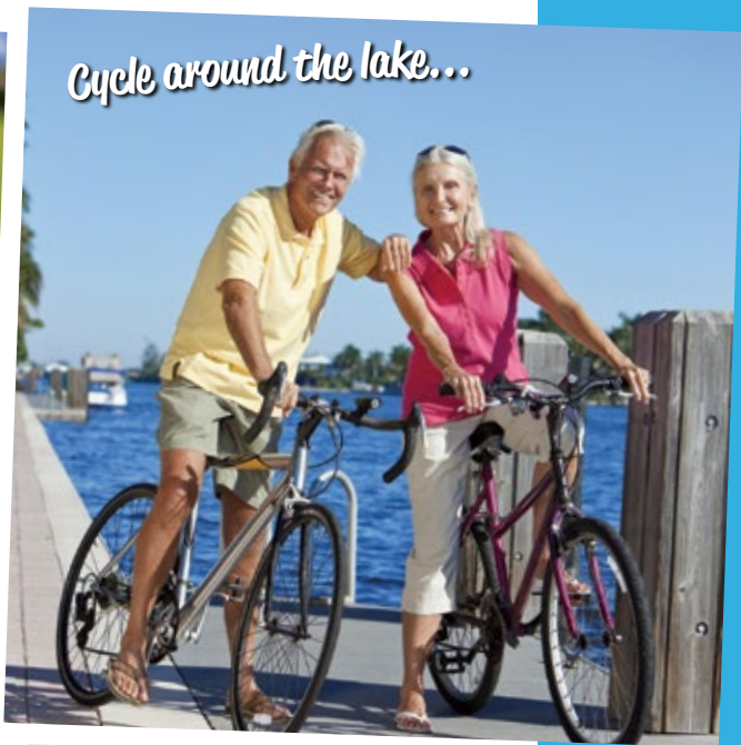
Cycle around the lake...