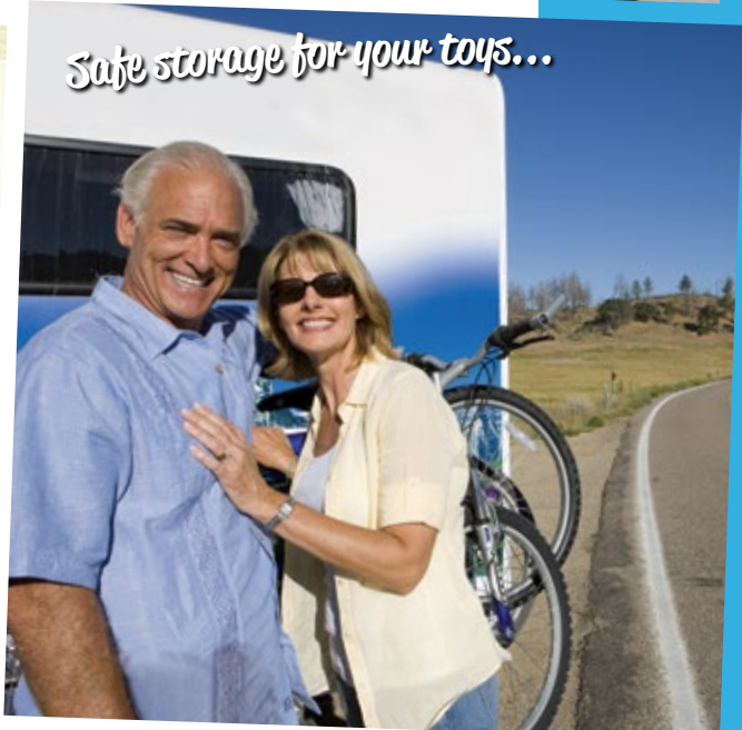
Safe storage for your toys...