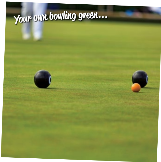
Your own bowling green...