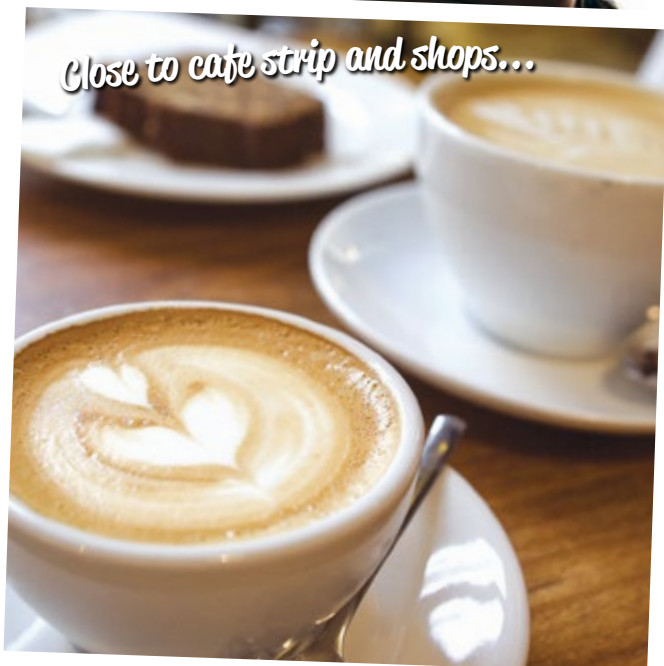
Close to cafe strip and shops...